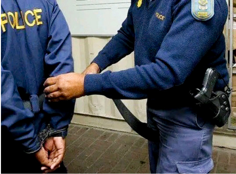
The DA in EMLM demands IPID to investigate the arrest of a police member linked to a major dagga bust in Groblersdal.

GROBLERSDAL - The Democratic Alliance (DA) in Limpopo has urged the Independent Police Investigative Directorate (IPID) to investigate the arrest of a SAPS member linked to a major dagga bust in Groblersdal last week.