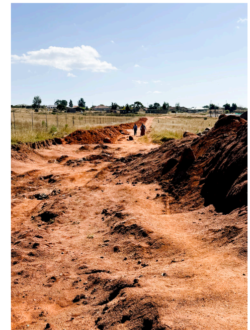
The Brooklyn to Makoshala Road Project has stalled as contractors allegedly abandoned the site over payment dispute with the municipality.