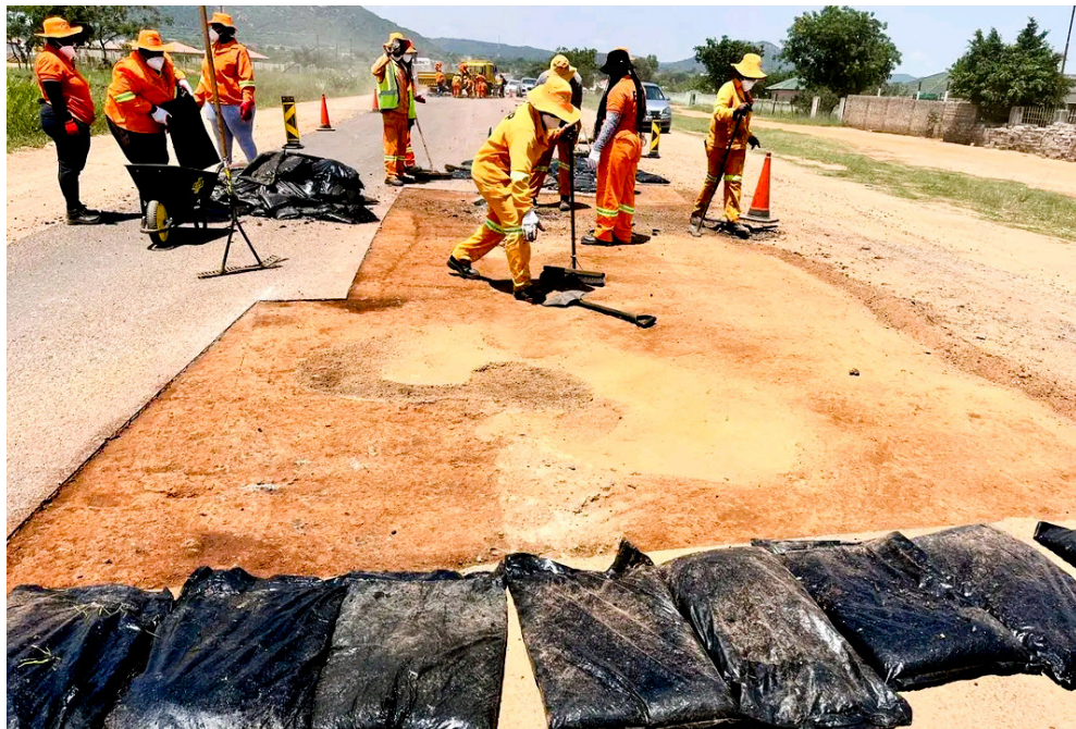
The R25 Road will get a proper facelift in the 2026/2027 financial year, as part of the government's broader plan to strengthen connectivity and support local economic development across Sekhukhune District.