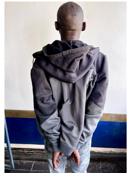
A 38-year-old man handed himself at the Nebo Police Station after allegedly fatally shooting his wife at Modimolle.