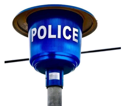
The police in Hlogotlou have arrested two suspects in connection with a mob justice incident that occurred at in Hlogotlou Unit B on Friday 15 May 2026.

"Mob justice is criminal and cannot be tolerated. Community members are urged to report suspected criminal activities to the police and allow the law to take its course. Taking the law into your own hands undermines the criminal justice system and often leads to loss of life," said Hadebe.