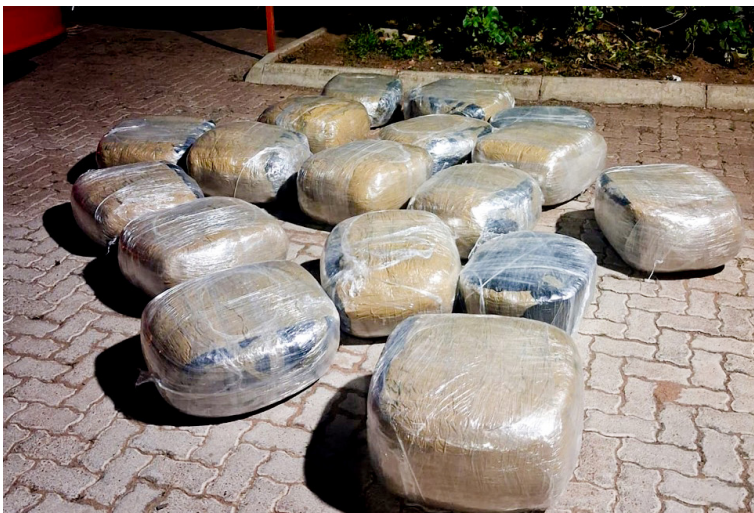
Large quantities of dagga that were recovered by the police during the arrests.

The police in Limpopo confirmed the case is being handled by the Limpopo Provincial Anti-Corruption Unit.