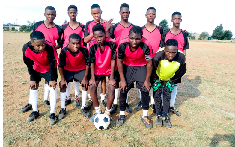
Jane Furse Blackpool FC secured a promotion to the Makhuduthamaga LFA League for the 2025/2026.

With results in, Jane Furse Blackpool and Madibong Sweepers finish as the top two sides and earn promotion to the Makhuduthamaga LFA League for the 2025/2026 season. Both clubs will now step up to face tougher