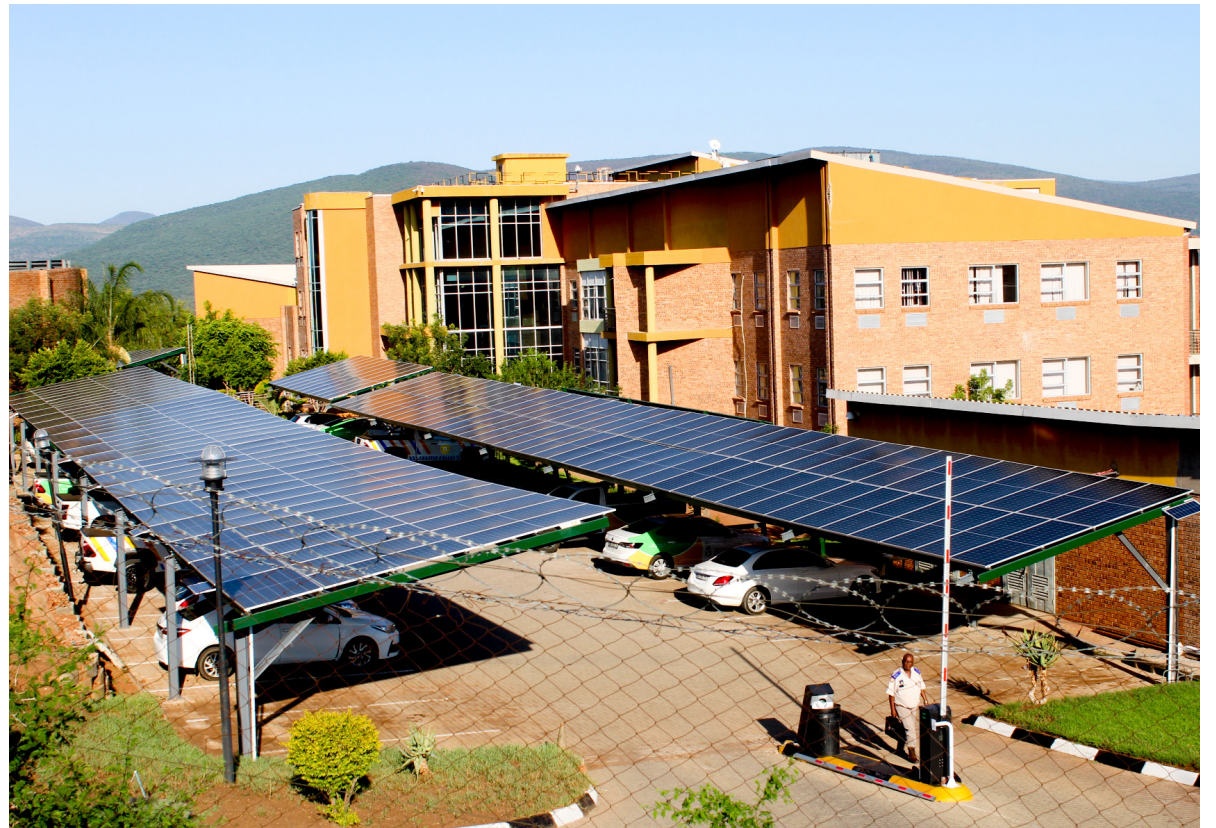
SMMEs attached to FTLM raised concerns accuse the municipality over corruption and favouritism in awarding tender contracts

"With regard to the allegation concerning the senior officials, no evidence has been presented to support the claim, and the municipality will not engage in speculation," she said.