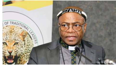
Deputy Minister for Traditional Affairs, Prince Zolile Burns-Ncamashe, urged for enhanced resource mobilization and a change in approach to safeguard the 2026 initiation season in Limpopo.