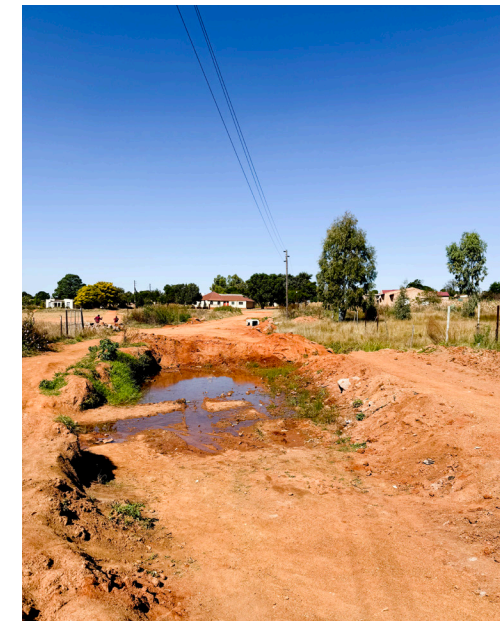
Residents of Brooklyn, Makoshala and neighbouring villages, were left frustrated after the road project in the area was halted in January 2026.