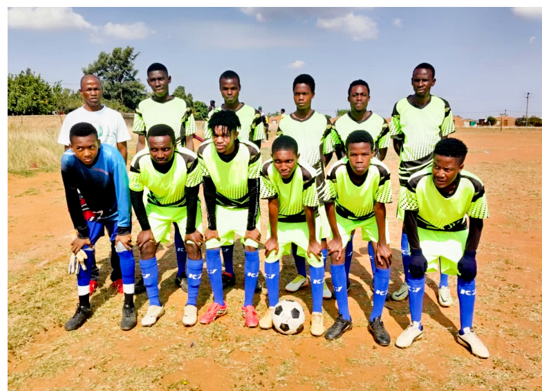
Mindollar FC was eliminated during the Makhuduthamaga Local Football Association Zonal League Playoffs played at Maredi Sports Grounds in Jane Furse on Saturday 16 May 2026.